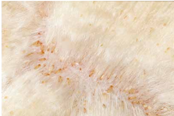
Fig. 1 Lice eggs, nymphs and adults on a very lousy sheep. The adult lice are 1- 2mm long.